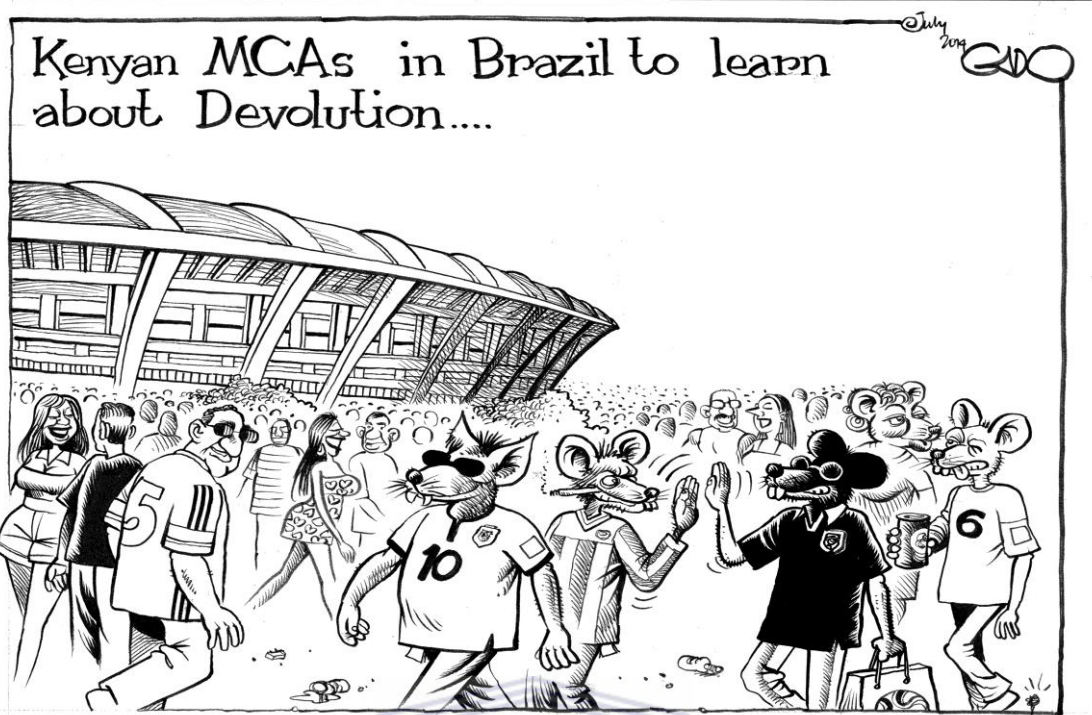
Figure 3.4 MCAs' demands for perks and overseas trips