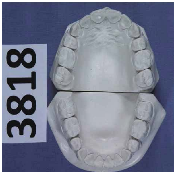
Figure 1: Plaster of Paris study model with allocated case number.

Department database at the Dental Faculty of the University of the Western Cape. All models had to have fully-erupted permanent teeth. This was purely a records-based (archival) study. No names or personal details of the patients were available. Models were identified only by means of a number (Figure 1). Patient confidentiality was therefore preserved.