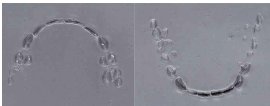
Figure 2: Wax bite patterns of the upper and lower teeth of case No 3818 (Coded U).

The method of bite mark comparison routinely used by author VMP is to trace the bite pattern of each jaw on plastic foil and to then superimpose the tracing over the actual bite mark. Thus the wax biting patterns of the upper