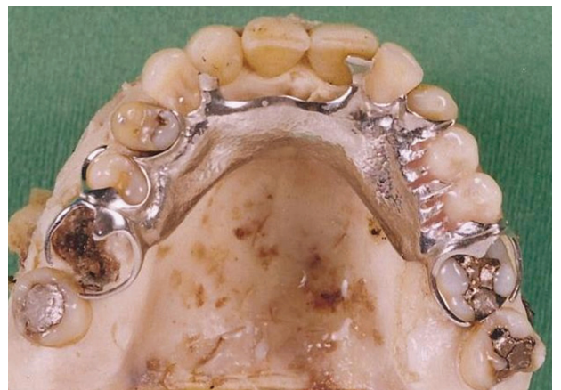
Figure 2: The newer upper chrome cobalt partial denture supplied by the victim's husband.

During the examination of the victim's dental data it became obvious that the chrome cobalt denture was old and did not fit the palate accurately (Figure 1). The author VMP subsequently contacted the victim's husband with regard to further dental information. The husband was questioned as to whether the victim had recently had a