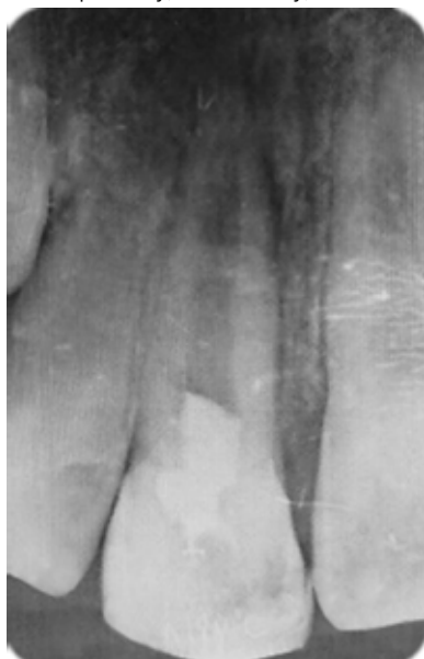
Figure 3: Two-month follow up of patient showing closing of the apex of tooth number 11.

The American Association of Endodontists (AAE) recognizes the potential in regenerative endodontics and hence has made the protocol a strategic priority. 16 The AAE Regenerative Endodontics Committee encourages endodontists to submit their cases to: http://www.aae.org/members/revascularizationsurvey.htm to create a larger data base for research. The degree of success of regenerative endodontic procedures, as laid out by the AAE, is largely measured by the extent to which it is possible to attain primary, secondary, and tertiary goals. 16