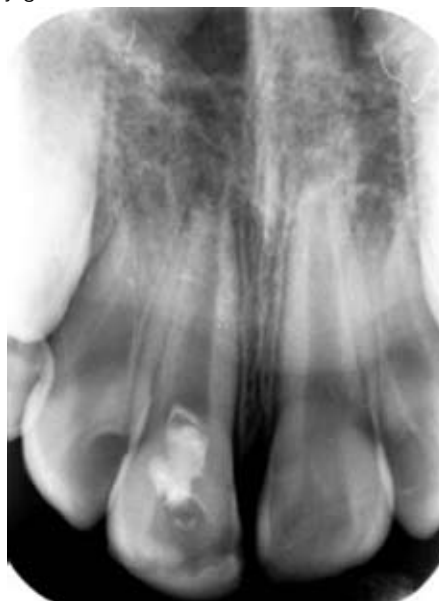
Figure 4: Apex on tooth number 11 closed following regeneration procedure after five-months follow up.

Primary goal: The elimination of symptoms and evidence of bony healing.